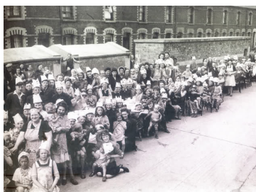
Foundry Street, Belfast