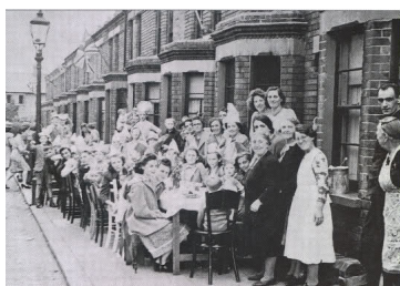
Ogilvie Street, Woodstock Road, Belfast