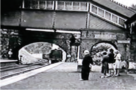
Cultra station as it was – and as it is today

The film portrays them setting off from Coleraine and apparently visually this might be plausible, down to the railway stationmaster's cap-badge. We are not, however, looking at Coleraine but at Cultra Station in North Down in 1942.