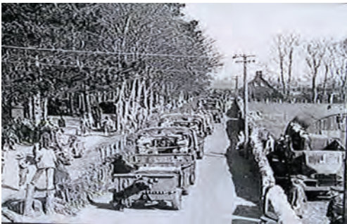
Bellarena Lane then – and now

Lady Heygate owned the Bellarena Estate between Limavady and Castlerock and in 1942 the edges of the fields were lined with Nissen huts and ready for the arrival of the US troops.