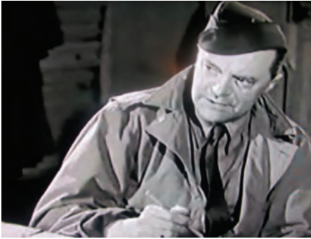
Captain Bruce Bairnsfather