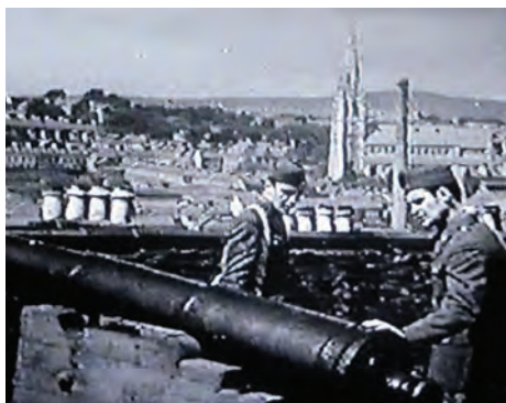
Roaring Meg as it was – and as it is today