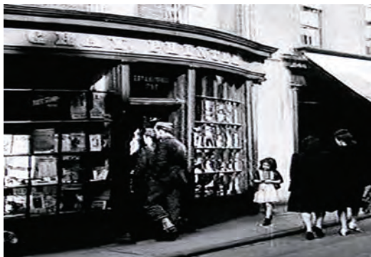
Gray's Printers as it was – and as it is today