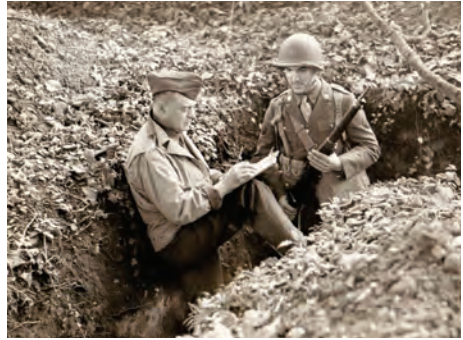
Sketching in trench