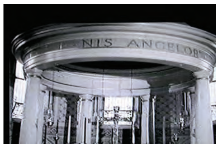
St Mary’s altar as it was – and as it is today