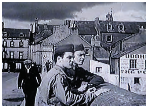
Strabane as it was – and as it is today