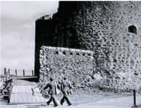
Carrickfergus Castle as it was – and as it is today

Some of the sites we see men visit have not changed in centuries let alone decades. They visit Carrickfergus Castle which remains one of the most visited tourist attractions in Northern Ireland today.