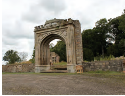
Tynan Abbey remains