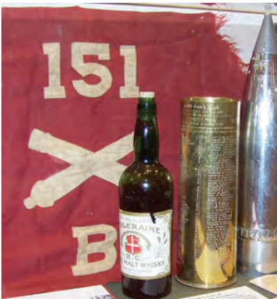
151st shell and whiskey bottle

Subsequently the shell has been engraved with a cross as each member of the 151st passes away. The aim is that the bottle of whiskey will remain with the shell “until only three of the original 116 members of the Battery remained alive, at which point the bottle would be opened and the surviving three would drink a toast to all their departed colleagues”.