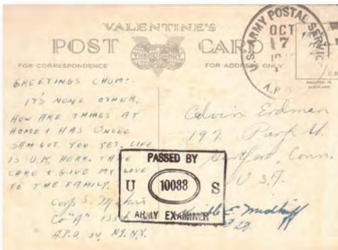
An actual GI's letter from Ulster

"Listen, you two. I've had two letters from your mothers and they haven't heard from you for six weeks, so sit down and write to them. I don't want to be bothered with this kind of letter. I'm far too busy". The boys replied; "Well, Sir, nothing ever happens here". The Colonel said: "Sit down and write to your mothers what has happened to you in the last two or three weeks". The boys promised to do so and their letters formed the basis of the screenplay. I returned to London. While I was away, the unit was transferred to the estate of Sir Norman Stronge, the Speaker of the Northern Ireland House of Commons, and whom the Americans referred to as Sir Strong. The picture therefore was made mostly on his estate".